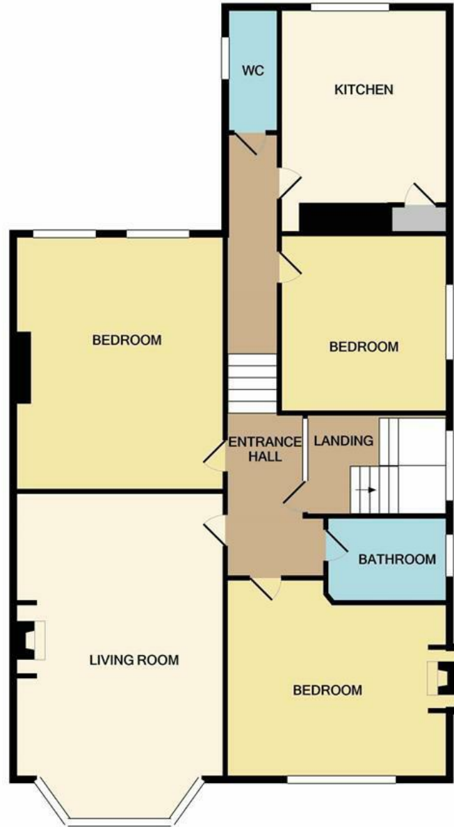
1ST FLOOR APPROX. FLOOR AREA 1180 SQ.FT. (109.6 SQ.M.)